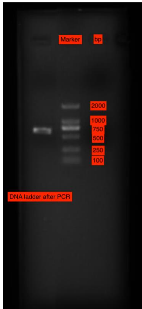
Figure 3. DNA ladder of endostatin(left) and the marker(right) after PCR

Fig 3 shows the DNA ladder that showed after the first gel electrophoresis. The DNA ladder of endostatin is shown on the left and the marker is shown on the right. By comparing the DNA ladder of endostatin to the ladders showed by the marker, the DNA ladder of endostatin is approximately a bit more than 500bp.