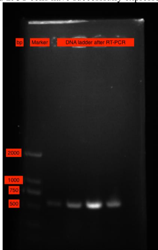
Figure 4. DNA ladder showed in the gel electrophoresis after RT-PCR.

shows the ladder of the marker and the rest of them are the ladder of the product DNA (four samples in order to make sure the result is correct). They are all approximately more than 500 bp which is the same as the result of the first gel electrophoresis. Therefore, the transfected 293T cells have successfully expressed endostatin.